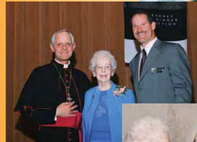
Art Rooney Award Dinner