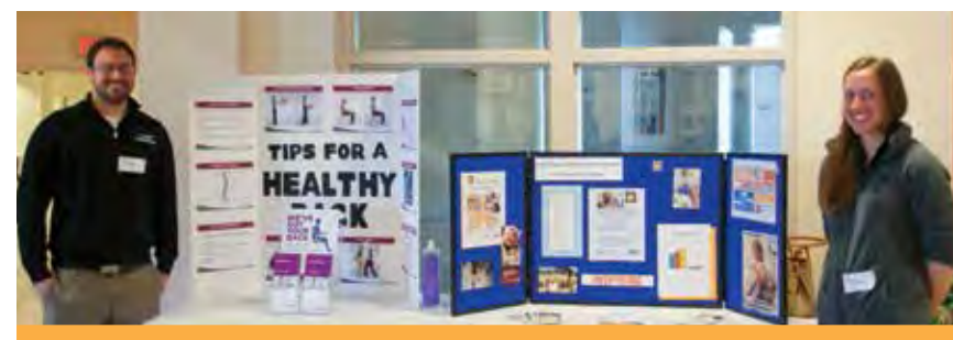
UPMC and Faith in Action show off their booth displays.