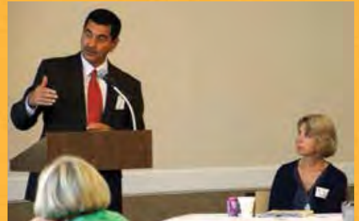
Citizens of the World Wellness Conference